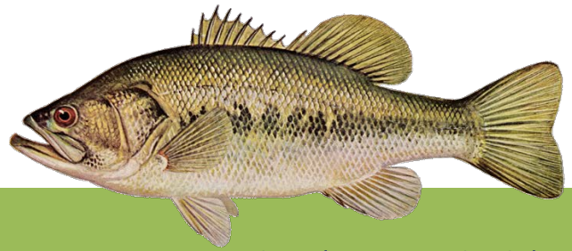
Largemouth Bass ( Micropterus salmoides )